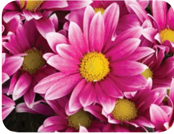
Mum Shannon White