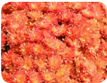
Mum Beverly Bronze